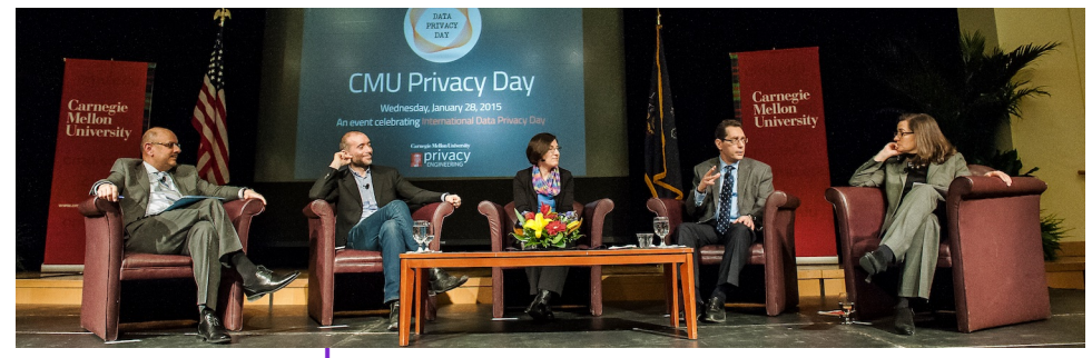
CMU faculty discuss their privacy research with FTC Commissioner Julie Brill at CMU Privacy Day in January.

The program concludes with a summer-long learning-by-doing capstone project, where students are brought in as privacy consultants to work on client projects. Our first class completed capstone projects for Facebook, American Express, and the Future of Privacy Forum. Our second class is working on projects for Lufthansa and SpiderOak.