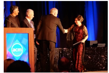
Lorrie Cranor was inducted as an ACM Fellow at an awards banquet in June.